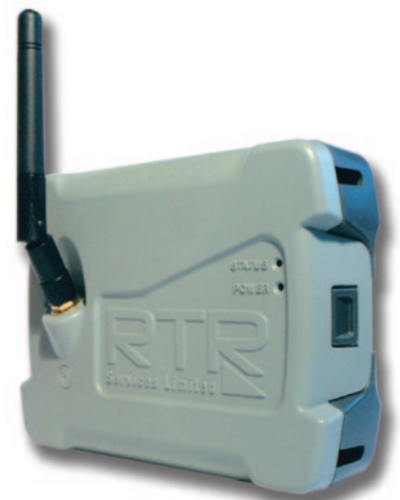
Shown with optional aerial

The unit can also be configured to provide GPRS / FTP data transfer as well as sending SMS and e-mail alerts for a range of situations, such as attempted unauthorised access. As the unit uses the mobile network, upgrading can be done wirelessly.