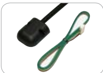
SSS-1 Cabling Kit Cabling kit for the SSS-1 sensor range