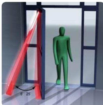
Detection Area Angle Adjustment