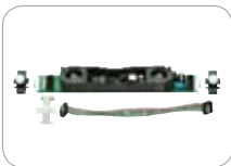
SSS-1 PCB Unit Kit PCB unit kit for the SSS-1 sensor range