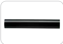
SSS-1 Filter cover Available in 340mm, 700mm and 900mm lengths