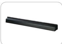
SSS-1-WC Black weather cover 700mm in length